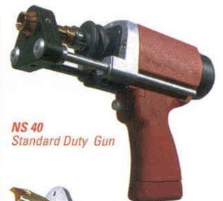
NS 40 Standard Duty Gun