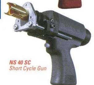
NS 40 SC Short Cycle Gun